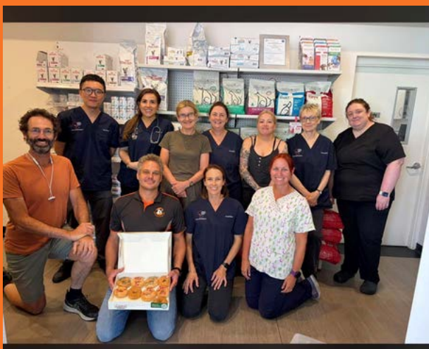
The PSV team

These developments demonstrate the strength of the Perth Street Vets model and its importance within VaCC's broader commitment to improving the interconnected wellbeing of people, nonhuman animals and communities through a One Welfare approach.