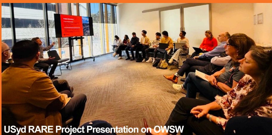
USyd RARE Project Presentation on OWSW

These figures reflect the power of collective effort.